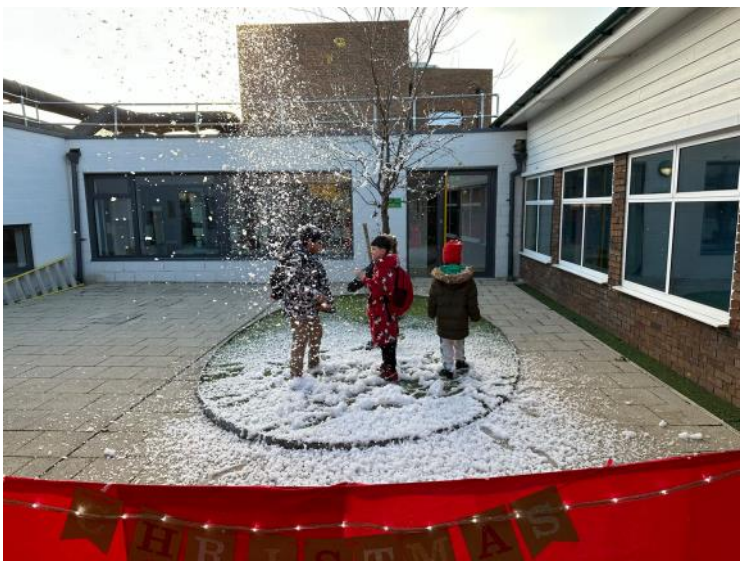
Father Christmas and his helpers brought some snow and much merriment to the Beavers Christmas Fayre on Friday!