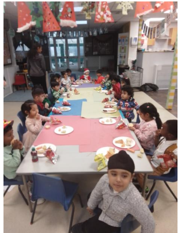
Nursery had a lovely Christmas party! Santa visited them and all the children loved receiving their presents. Thank you Santa!