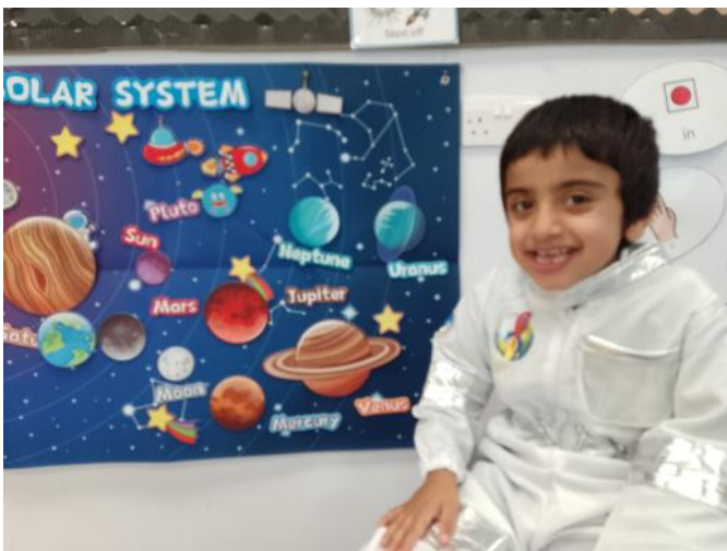
Sunshine Class has been exploring Space, through creative art and craft. Dressed as astronauts, the children brought the universe to life with colourful displays full of imagination and wonder.

There are spaces in all the clubs if you wish your child to join. Please ensure you make payment on ParentPay. To book Jam Coding please visit https://tinyurl.com/jc25sumbea