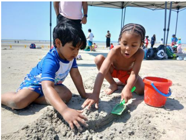
Reception West Wittering Beach 2025