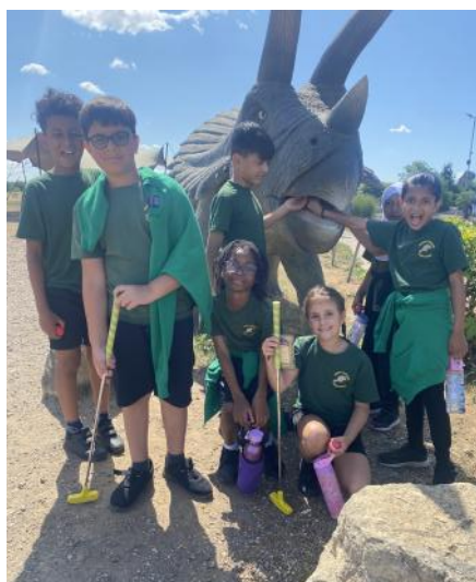
Year 4 went to Good Time Golf in this week; they played Footgolf and Adventure Golf and had a fabulous time.