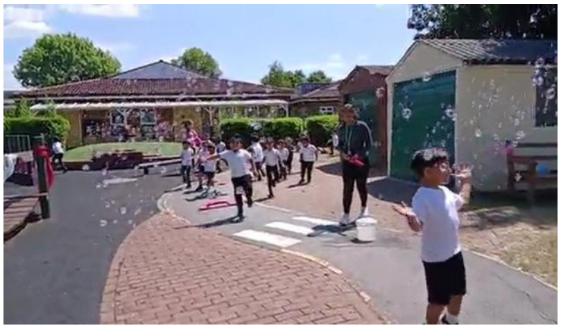
The Nursery children had a lovely time during their bubble run event!