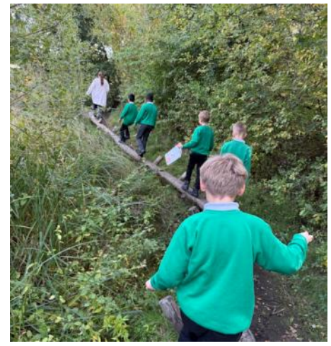
Year 4 went to the Wetland Centre this week. Children explored the wetlands on their Generation Wild Walk observing plants, animals and taking part in nature-based activities.