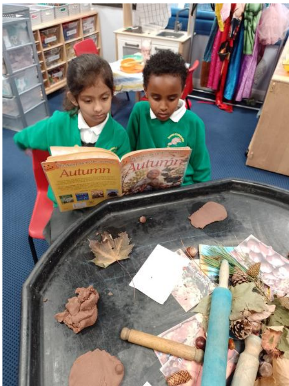
Year 1 have been looking at seasonal changes in science. They explored autumnal objects in the tough tray and made patterns with it in the playdough.