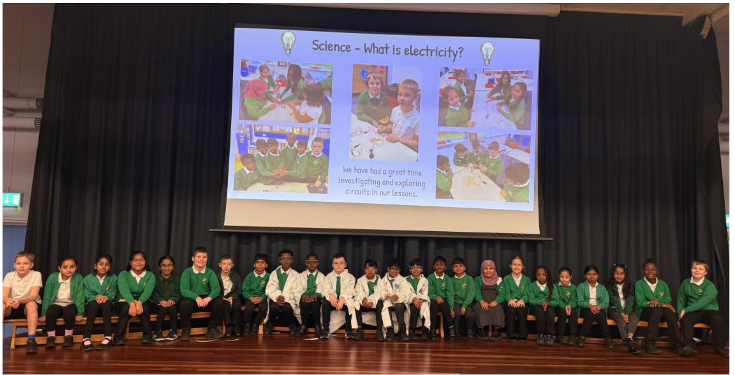
Lavender class had their class assembly and parents came to watch too. It went very well and they worked super hard.