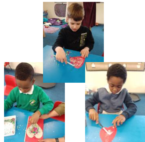
Starlight class have been busy making some Valentine's Day cards and decorating biscuits.

Everybody all around the world. Racism, why do they do this? You got ears so fight them back. You got the power, you got the voice. So scream until racism is over! So shout and fight. Sing along until this bullying is Done! Why do people do this? I hope the world could be a fantastic place. I hope everyone could be kind. I hope the word Peace could be looked up more in the dictionary, So everybody could use it more I might not fix the world But I have my friend Don't hide in your shadow. Stand up and be proud