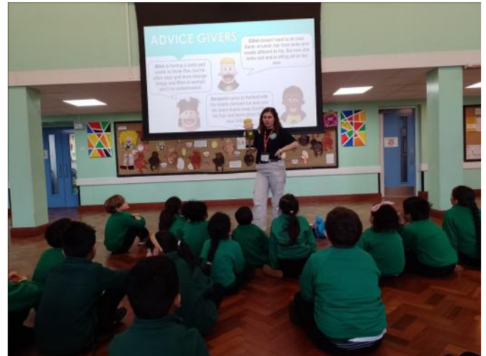
Year 1 enjoyed the big foot workshop this week